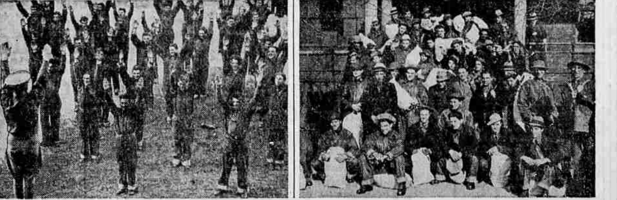
These pictures show how recruits from the unemployed are enrolled and trained for $30-a-month jobs in the national forests.