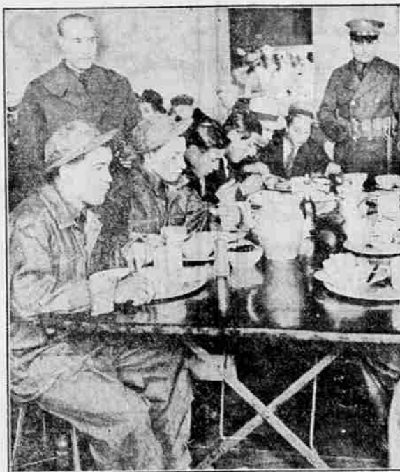
Some of the first contingent of men recruited into President Roosevelt's reforestation army are shown enjoying their first mess at Fort Slocum, New Rochelle, N. Y. They are wearing the special uniforms in which they will work in national forests.