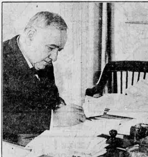
Josephus Daniels, newly appointed ambassador to Mexico, is becoming acquainted with the problems his new duties will bring at the state department in Washington where rooms have been set aside for new ambassadors to learn the details of their assignments.