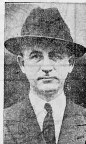
Sumner Welles was nominated as ambassador to Cuba by President Roosevelt.