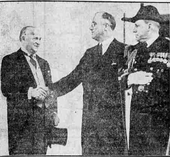
Preliminary to joining the international economic conversations in Washington, Canada's representative, Premier Richard B. Bennett, paid a social call at the White House. He was greeted at the executive mansion by President Roosevelt.