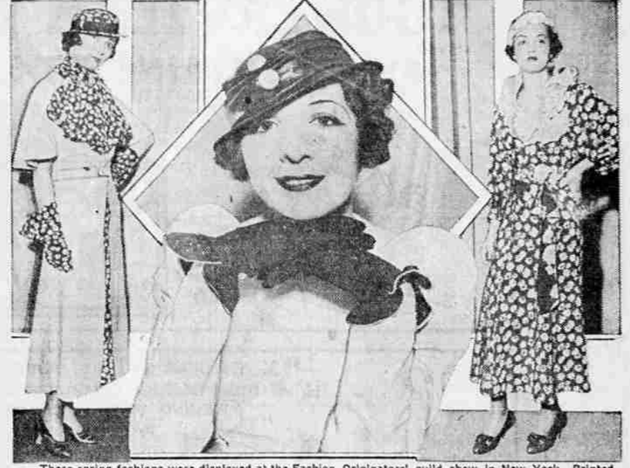
These spring fashions were displayed at the Fashion Originators' guild show in New York. Printed gloves, hat and scarf are particularly attractive with the type of coat shown at left. The dress also matches. A hat of black ribbon is shown in the center. At the right is a white and navy blue afternoon frock. The collar is of orquidie.