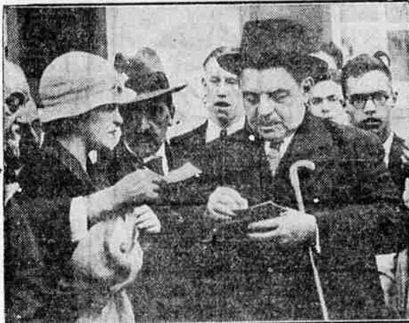
When Edouard Herriot, former French premier, paid a visit to Washington's old home at Mount Vernon, Va., he was besieged by tourists seeking autographs. He is shown here filling the orders.