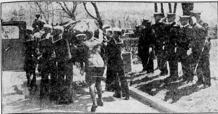
Rear Adm. William A. Moffett, a victim of the Akron disaster, was buried with full naval honors in Arlington national cemetery, Washington. A company of sailors and a company of marines formed a military escort with the secretary of the navy, Claude Swanson, in attendance at the grave. Ranking admirals served as honorary pall bearers. The flag draped casket is shown being placed on a gun carriage at the entrance to the cemetery.