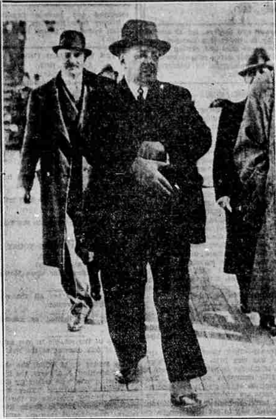
Edouard Herriot, former premier of France, is shown in this Associated Press telephoto as he landed in New York to attend the economic conferences in Washington with President Roosevelt.