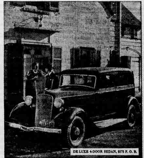
DE LUXE 6-DOOR SEDAN, 112" F. O. B.