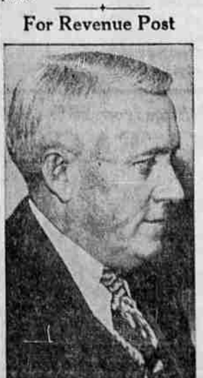
According to reports from well informed circles the administration has decided upon Guy T. Heilvering, a former representative from Kansas, for commissioner of Internal Revenue.