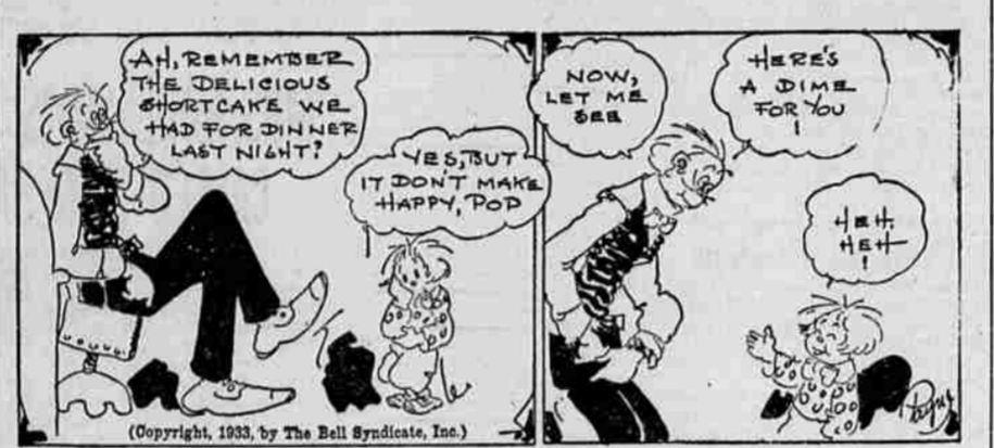
(Copyright, 1933, by The Bell Syndicate, Inc.)