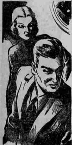
"Go bring wood," I said.

The priest had gone, and the little porter wore an anxious look, and Sue Tally was standing there beside him.