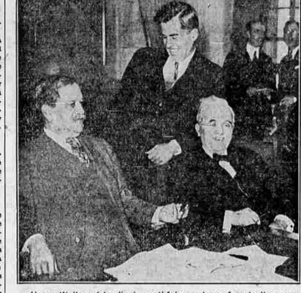
Henry Wallace (standing), youthful secretary of agriculture, went before the senate agricultural committee and insisted on enactment of the administration bill for farm relief. Shown with him are Senator Smith (left) of South Carolina, chairman of the committee, and Senator Norris of Nebraska.