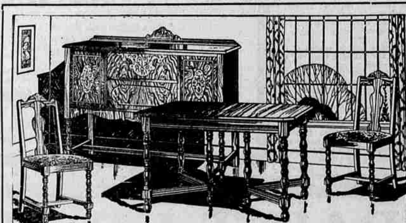
A Real Value Walnut Finished Dining Suite

Axminster RUGS Now—an opportunity to secure a beautiful Axminster rug at a very low price—look at these prices! Three groups to choose from in 9x12 size. $18.00 $19.95 $24.95 A real value for those needing an extra chair. Quantity buying enables us to offer fine occasional chairs at this low price. An assortment to choose from. $3.95