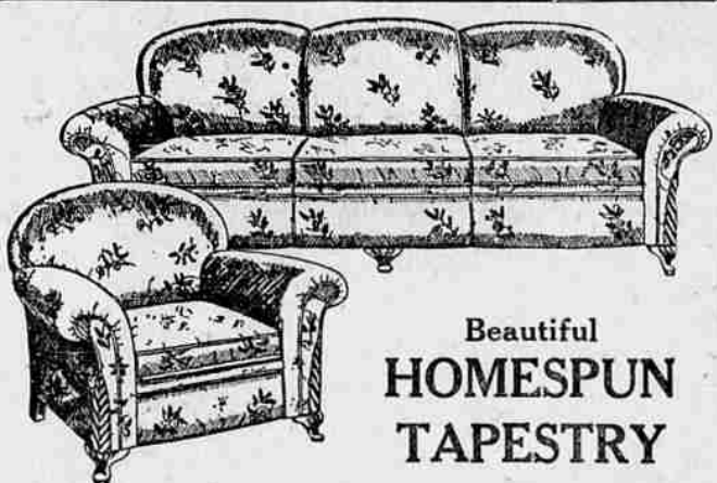
Beautiful HOMESPUN TAPESTRY

Davenport Sets Brand new sets—Genuine Homespun Tapestry—and built for many years of hard service. Just look at this astonishingly low price, for davenport and chair $32.50