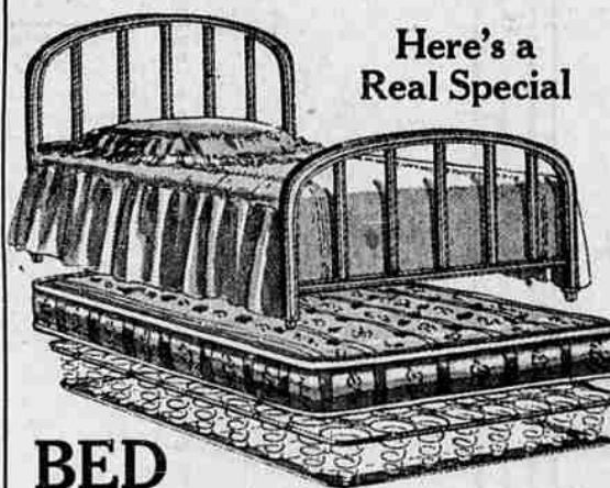
Here's a Real Special

Sale of Lamps Here you'll find some brand new shapes and styles in table lamps. Very attractive, complete. With shades, only $4.50 Reflector lamps with three side brackets—you'll be delighted with these lamps and pleased with this low price. $7.95 $1 Down—$1 a Month