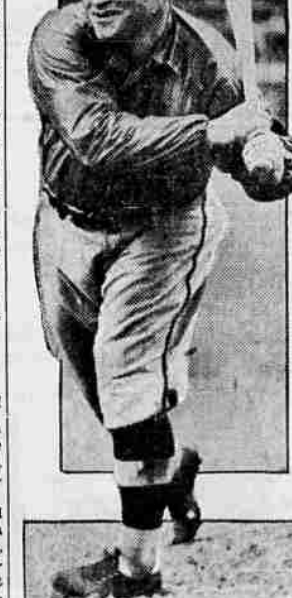
His salary difficulty having been ironed out, Hack Wilson is now devoting his entire time to big stick work at the Brooklyn Dodgers Miami, Fla., camp.