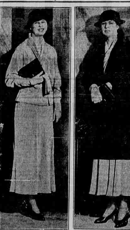
Mrs. Franklin D. Roosevelt appears in the gown she wore at the inauguration of her husband as president yesterday. At the left she is shown in the "Eleanor Blue" dress of velvet, and at the right she wears her wrap of "Anna blue," named after her daughter, Anna Roosevelt Dall.