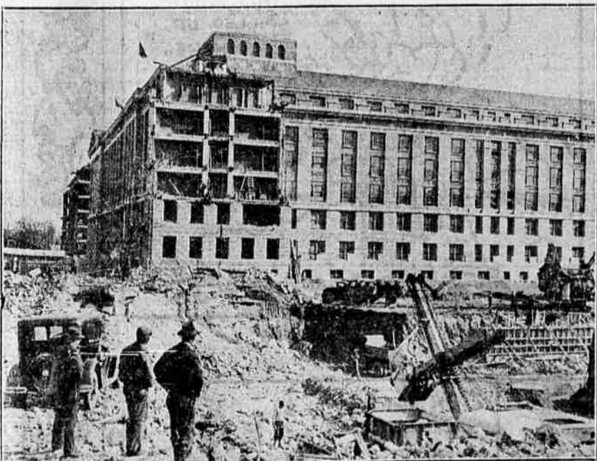
Scarcely had the new agriculture department building been completed in Washington before parts of it were torn down. This was done, it developed, because congress had appropriated money to make the new building larger. The partial wrecking cost $50,000.