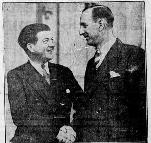
Robert La Follette of Wisconsin hands over the distinction of being the baby member of the senate to Richard B. Russell, Jr. (right), Georgia's new senator. Russell enters national politics at the age of 35 after completing a term as governor of Georgia. La Follette, who entered the senate at 31, will be 38 in February.