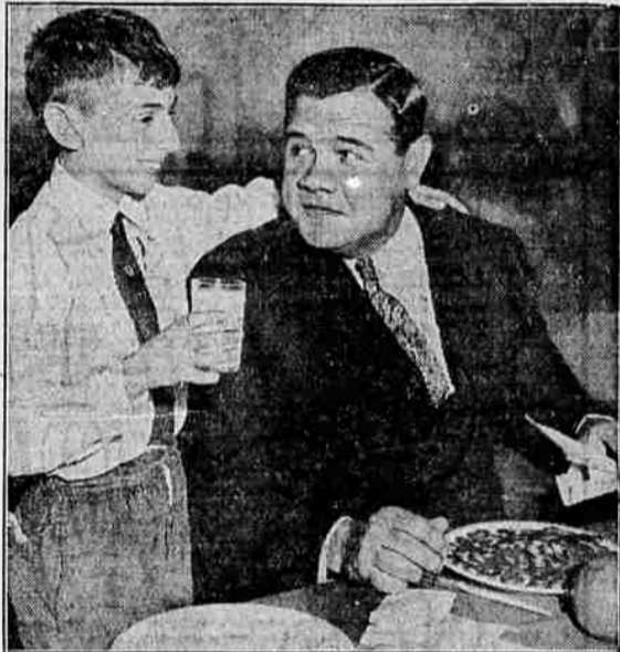
Babe Ruth, Yankees' slugger and idol of American youth, is shown lending a thrill to one of his young admirers at a "share-a-meal" club dinner in New York. The movement, backed by boy and girl clubs, seeks to raise money with which to buy food for hungry New York children.