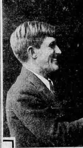
Eddie Peabody, America's foremost banjo artist and identified as one of the outstanding entertainers of the theatrical world, has signed a contract with the Safeway Stores for a series of weekly broadcasts commencing over the National Broadcasting company network Wednesday evening February 8th, at 7:30 o'clock.