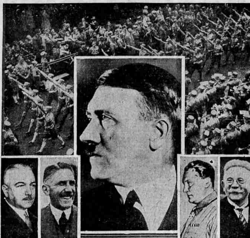
Adolf Hitler (center), picturesque leader of the German fascists, is the new chancellor of Germany in granting the fiery Nazi chief the long sought place at the head of the government. President von Hindenburg surrounded him with a compromise cabinet of conservatives like Konstantin von Neurath (left), who remains foreign minister; Franz von Papen, (second from left), former chancellor and confidant of the president, and Alfred Muegenberg (right), the nationalist chief. Herman Goerring (second from right), one of Hitler's chief lieutenants, was made a minister without portfolio. Picture above shows some of Hitler's famous Nazi storm troops.