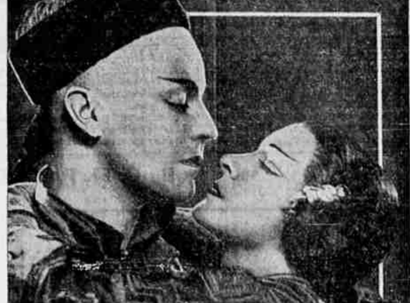
RAMON NOVARRO and HELEN HAYES in "THE SON-DAUGHTER" by Lenore Ulric; and Ramon Novarro playing the Chinese prince whose affliction with the royalist revolution has its aftermath in a series of political intrigues and tongs wars in San Francisco's Chinatown.