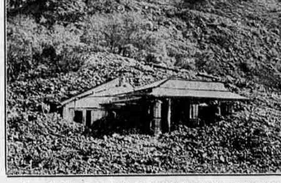
Tons of boulder and gravel, loosened by heavy rain, tumbled down and half-buried this service station on the Roosevelt highway near Oxnard, Cal.