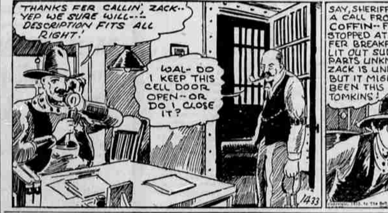
THANKS FER CALLIN' ZACK... YEP WE SURE WILL... DESCRIPTION FITS ALL RIGHT!