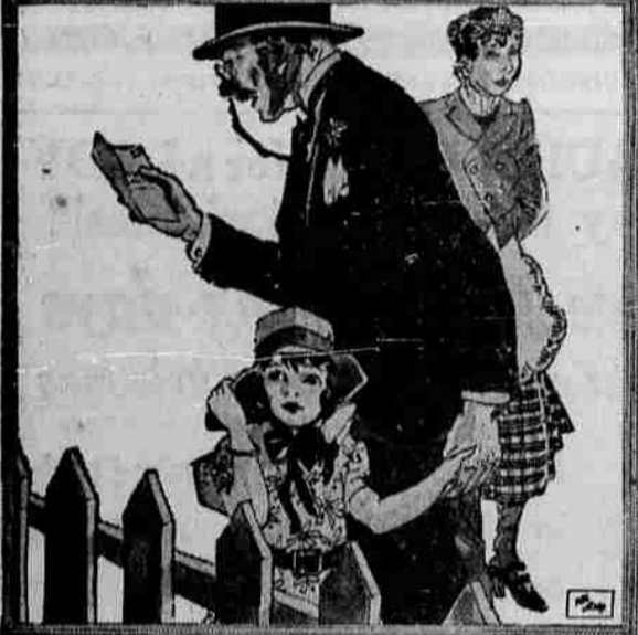
Cane opened and read the telegram.