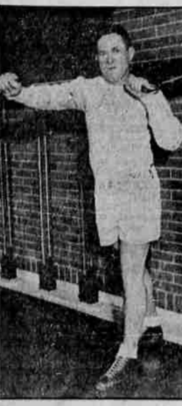
Rogers Hornsby, who hopes to make something of a comeback next year with the St. Louis Cardinals, has begun his winter training in a St. Louis gymnasium.