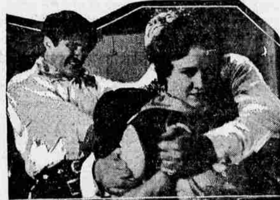
Thrilling action and a blazing western story are featured at the Holly theater today and tomorrow. Short subjects will feature a cartoon, "Forty Thieves," a Dodge Dodge, Woman's Work, a McNamee news reel and a cartoon. Kiddies are looking forward to the 5-cent matinee to be held Saturday.