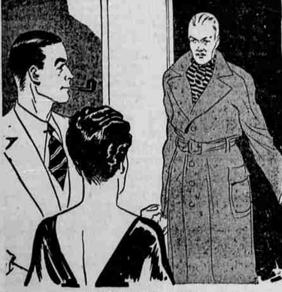
There in the passage stood Dak.

registrations this year over last year, and in line with that fact Lakeview has had increased travel. Other points and sections in the Wonderland showed increased travel this year over last. It is reported that traffic gained all summer between Red Bluff and Susanville, and also that a 10 per cent increase in travel was noted between Redding and Eureka. When needing duplicating sales books, flat-packs or fan-fold cash register forms, ledger sheets for bookkeeping machines or any other kind of printing, don't order from out-of-town firms and pay more. Phone 75 and one of our representatives will call. Marshall-Smith-Leonard, oor. Main and Grape, have some good bargains in greeting cards. Drop in early for best selections. Real Estate or Insurance—Leave a large increase in out-of-state auto