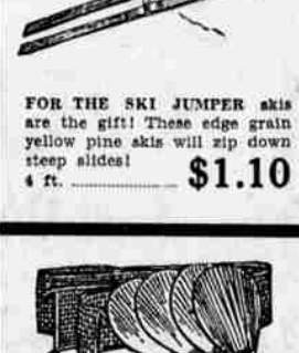
TABLE TENNIS SETS

Marahall-Smith Leonard, cor. Main and Grape, have some good bargains in greeting cards. Drop in early for best selections. Indexed Dickson Bibles. Tel. 745-H. Or Deel liver. Special cooking processes make ALL-Bran finer, softer, more palatable. Equally tasty as a cereal, or used in cooking. Recipes on the red-and-green package. Sold by all grocers. Made by Kellogg in Battle