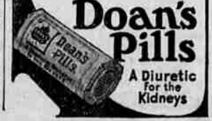
Doan's Pills A Diuretic for the Kidneys

Are you bothered with bladder irregularities; burning, scanty or too frequent passage and getting up at night? Heed promptly these symptoms. They may warn of some disordered kidney or bladder condition. Users everywhere rely on Doan's Pills. Recommended for 50 years. Sold everywhere.