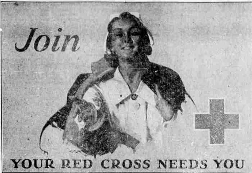
The 1932 poster of the American Red Cross Roll Call for members.

EVERY year, beginning with the World War, the Red Cross has issued a poster calling attention to its roll call for membership, which is held, traditionally, from Armistice Day to Thanksgiving Day. Many famous artists have painted these