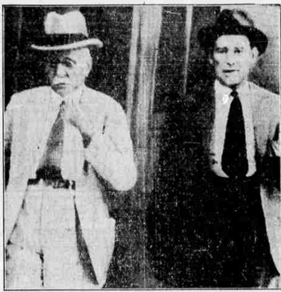
This Associated Press telephoto shows Samuel Insull (left), former Chicago utility magnate, as he was photographed in Athens, Greece, shortly after he was indicted in Chicago on charges of embezzlement and larceny.