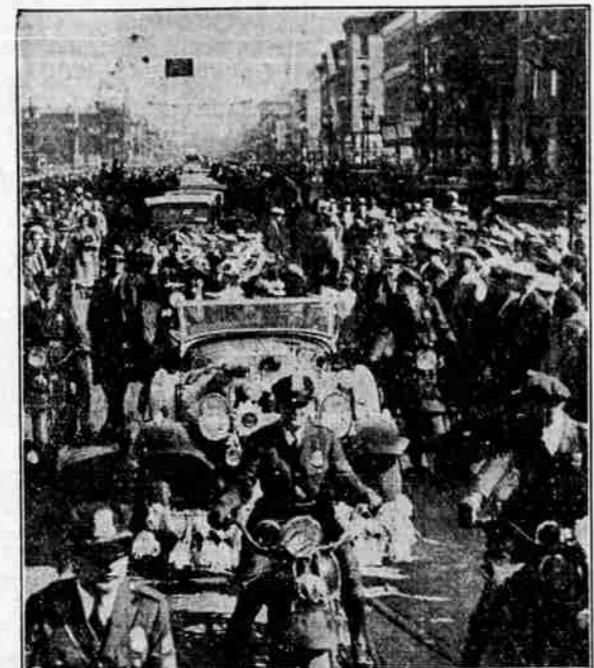
A crowd estimated by police at 50,000 was jammed into "monument circle" in the heart of Indianapolis when Gov. Franklin D. Roosevelt spoke there during his new campaign tour. At the left Governor Roosevelt's car is shown being escorted through Indianapolis streets. Part of the crowd that heard him speak is shown at the right.