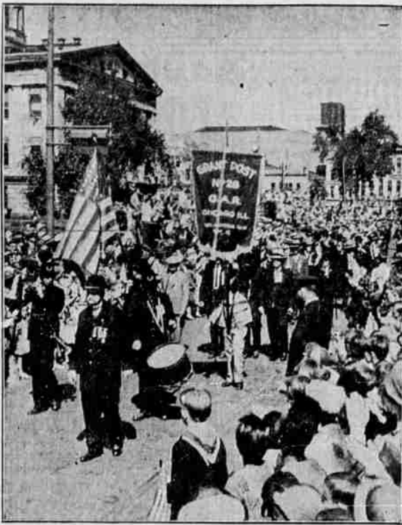
More than 600 veterans of the Civil war mustered enough pep to march in the parade at the sixty-sixth annual encampment of the G. A. R. at Springfield, Ill. Veterans playing the fife and drum are shown leading the march.

while only 303,338 departed. On May 20, 1924, to check this influx of immigrants from war-stricken Europe, a Republican congress passed a drastic restrictive law. The wisdom of this policy of protecting American workmen cannot be doubted and should be commended by all citizens. This law has been of benefit to the working man of the United States, but this did not check the flood of immigration to the United States. It is estimated that there are now several million aliens within the United States, illegally. The law was further amended until the number dropped to 290,297 immigrants, of which 77,899 departed within one year.