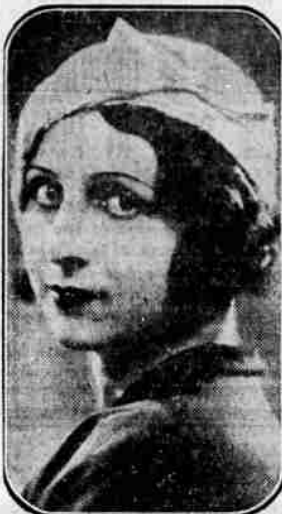
Here's a novel type of white velvet hat, equally smart with a tailored suit or sports dress.