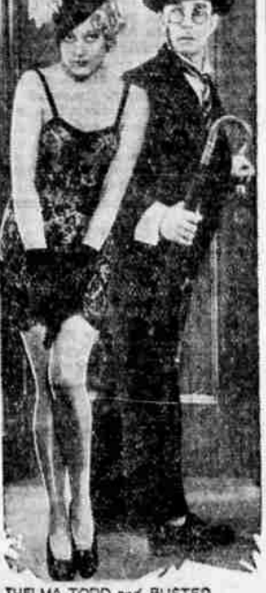
THELMA TODD and BUSTER KEATON in "SPEAK EASILY"

"Dead pan" and "long nose" is the latest in popular comedy contrasts! The fun riot started by the combination of Buster Keaton and Jimmy ("Schnozzle") Durante is continued in "Speak Easily," which comes to the Fox Craterian tomorrow.