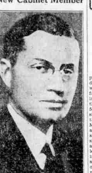
Roy D. Chapin (above), Detroit automobile manufacturer, is the new secretary of commerce, succeeding Robert P. Lamont, who resigned.