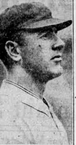
Charlie Grimm (above), captain and first baseman of the Chicago Cubs, was chosen as the team's manager after Rogers Hornsby was ousted from the post.