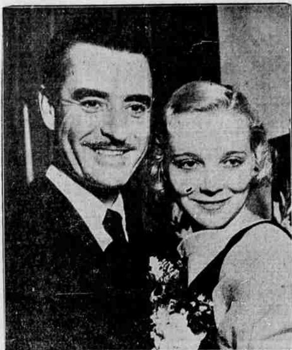
John Gilbert, romantic player of the films, and Virginia Bruce, former Follies dancer, pose just after their marriage in Hollywood. It is his fourth matrimonial venture.