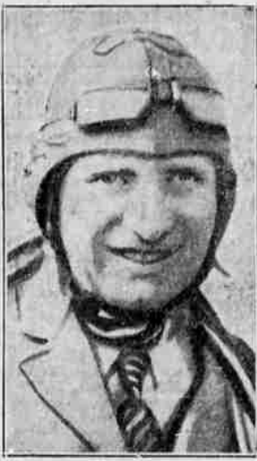
Wolfgang von Gronau, German flier, took off from Germany on a second flight westward across the Atlantic. His route is by the way of Iceland, Greenland and Labrador.