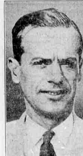
Jose Jurado (above), Argentine golf star, has come to the United States to compete in the American, western and Canadian open championships. He also will make an exhibition tour with Walter Hagen.