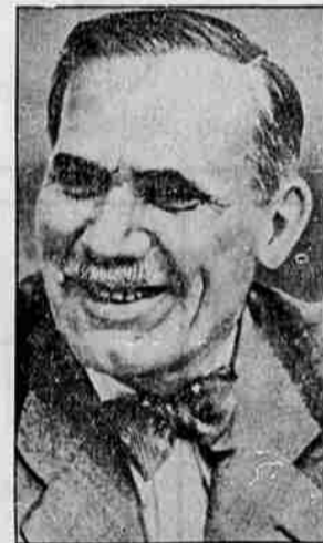
Henry Field, "amateur" in politics after a career as seed grower, radio station owner and caterer to farm family needs, shows his "victory smile" as he won the republican nomination for United States senator from Iowa, defeating Sen. Smith W. Brookhart.