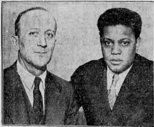
William Z. Foster (left), general secretary of the Union Unity League of New York, was named the presidential candidate of the communist party of America at its convention in Chicago. James W. Ford (right) of Pratt City, Ala., was nominated for vice-president.