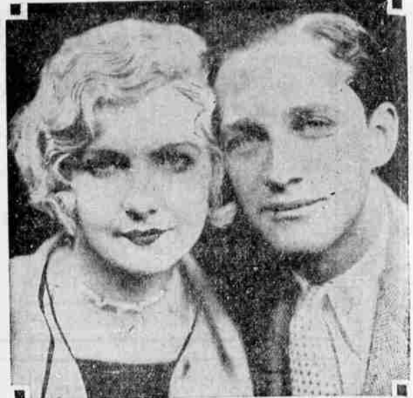
Edna Murphy, former stage and screen actress, has filed suit for divorce against Mervyn Leroy, film director, in Los Angeles.