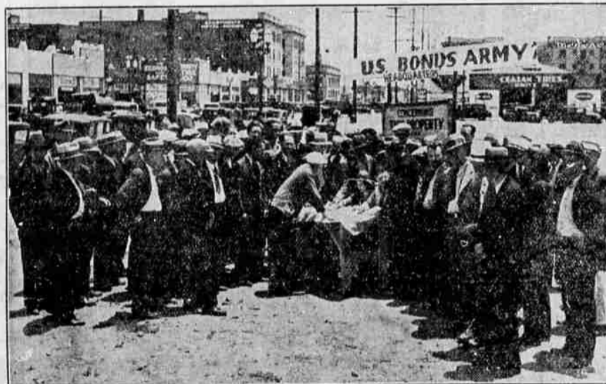
Former World War service men at Los Angeles sign up for "bonus march" to Washington, D. C.