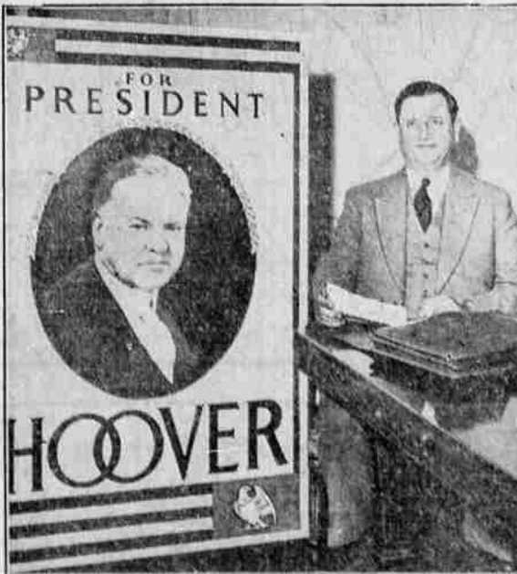
Everett Sanders, new chairman of the republican national committee, opened the republican campaign headquarters in Chicago. He is directing the campaign of President Hoover and Vice President Curtis.