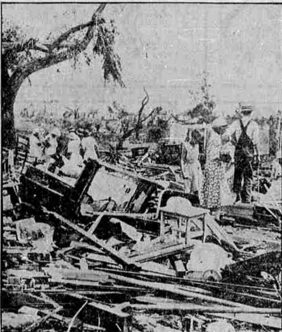
This scene of destruction in the little town of Washington, Kas., shows some of the damage wrought by a tornado which killed three persons and injured more than 20 others.