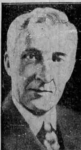
Col. Frank E. Webb, former presidential nominee of the farmer-labor party, was nominated for president by the liberty party at its convention in Kansas City.