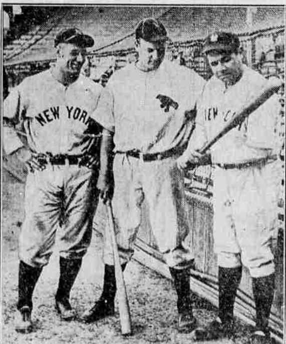
The Bambino willingly proffered Buzz Artlett (center) advice on the manufacture of home runs when the Yankees dropped off in Baltimore for an exhibition game, but it was something like telling a chicken how to lay an egg. The Big Oriole at the time led the world in homers with 41. Ruth is shown in action at right, with that other eminent slugger Lou Gehrig ready to contribute.