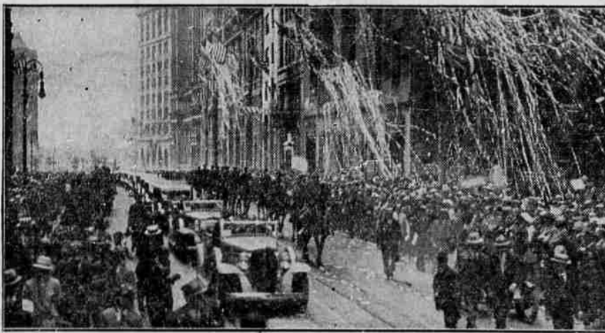
Notables from air, land and sea joined in a tumultuous welcome to Mrs. Amelia Earhart Putnam, first woman to fly solo across the Atlantic, when she returned to New York. Upper right: She views the harbor demonstration from a city tug with her husband, George Palmer Putnam. Upper left: Mayor Walker welcomes the flier in the name of the City and presents the city's medal. Below is a view of the triumphal procession on lower Broadway.