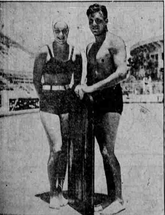
Helene Madison and Buster Crabbe, America's two greatest free style swimmers, will carry most of the hopes of the United States in the Olympics. They are shown after a recent workout in Los Angeles.