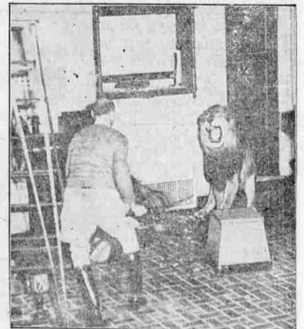
Ho, for the life of a cameraman. Runaway lions are not outside his realm. This picture was taken as Leo the lion was subdued by his trainer after running amuck in a Boston radio studio. Leo was billed to go on the air but 150 persons gathered to watch the performance had an entirely different show. He hurled his 300-pound bulk through a double plate glass window and bounded from room to room. Six were hurt in the panic that ensued.