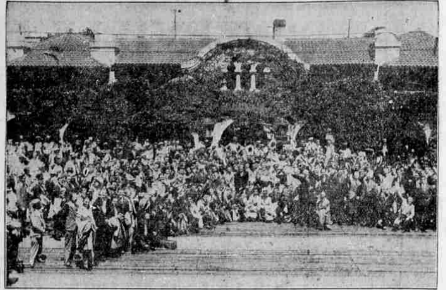
More than 200 eastern athletes who will compete in the fifty-sixth annual I.C.A.A.A. track and field championships at Edwards stadium arrived in Berkeley, Cal., aboard the "Intercollegiate special."