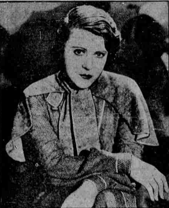
Ruth Chatterton, film actress, is pictured in a smart street ensemble of black and grey tweed. The coat has a short detachable cape which is fastened at the front in scarf fashion.