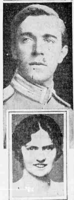
The engagement of Prince Gustaf Adolf, eldest son of the Swedish crown prince, to Princess Sibylla of Sachsen Coburg Gotha was announced recently.