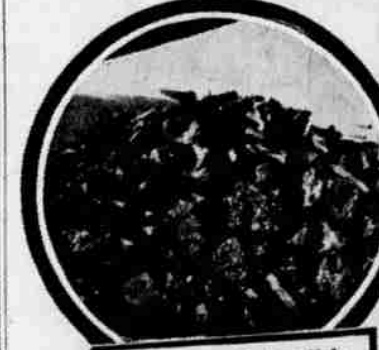
From a 35c oil—hardfules of hard carbon formed in a few thousand miles

of hard carbon scratching your engine's polished cylinders... pitting the valves... cutting its way around and around the bearing surfaces