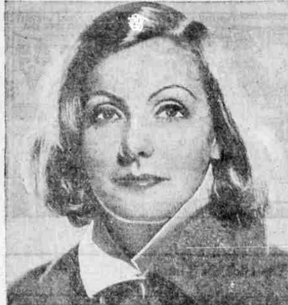
Greta Garbo is leaving the screen, as reported in the nation's press. According to her announced intention the very zenith of her career, she plans to go into retirement and return to her old home in Sweden.