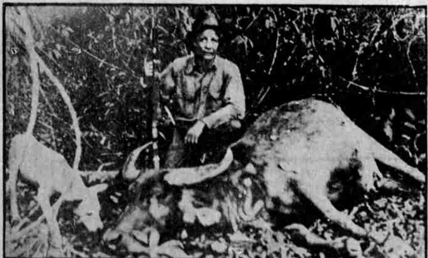
Like several other members of his family, Theodore Roosevelt Jr. is quite a big game hunter. The new governor-general of the Philippines is shown with a wild caraboo which he bagged with a single shot from 150 yards in northern Luzon.