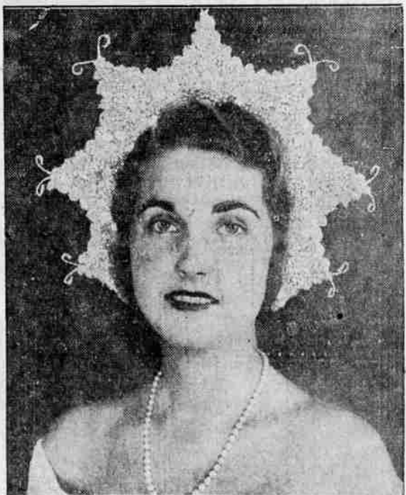
Barbara Hutton, heiress to the Woolworth millions and prominent in New York society, shown as she will appear when she leads the pageant at New York's charity carnival.