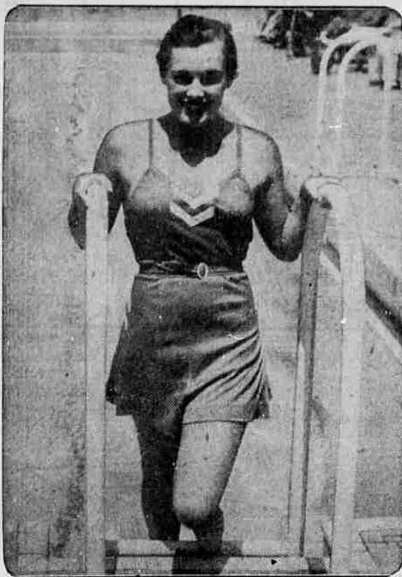
Eleanor Holm of New York, one of America's swimming champions, appeared in this new low-cut swimming suit at the Olympic pool in Los Angeles. Miss Holm, a leading candidate for the United States' Olympic swimming team, is training for the National Amateur athletic union indoor championships.