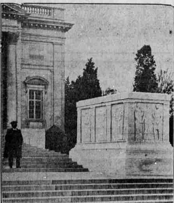
A new 13-ton marble slab recently placed over the grave of the Unknown Soldier in Arlington cemetery, Washington, completes the shrine to America's soldier dead. The marble block was rejected once before because of a flaw.