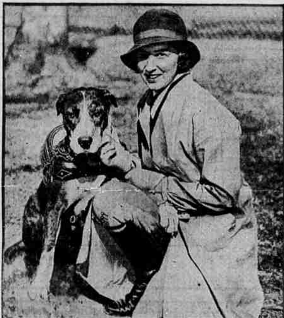
With the arrival of spring and the dog-catcher, Mrs. Irene Castle McLaughlin, famous dancer of several years ago, is renewing her campaign to provide homes for homeless animals. She sponsors an "animal shelter" near Deerfield, Ill., and is shown with one of her many pets.