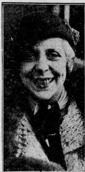
Vicki Baum, German playwright, is shown as she arrived in New York for a stay during which, she said, she intends to become an American citizen.