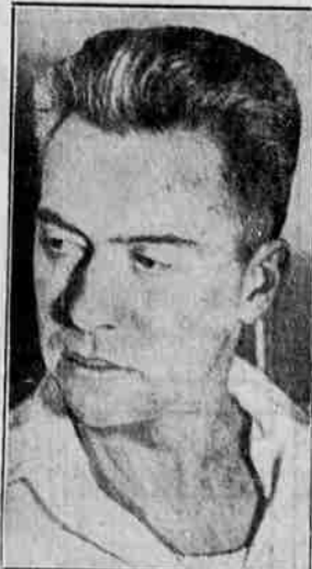
Hart Crane, Cleveland poet, was lost at sea from the liner Orizaba while en route from Vera Cruz to New York.