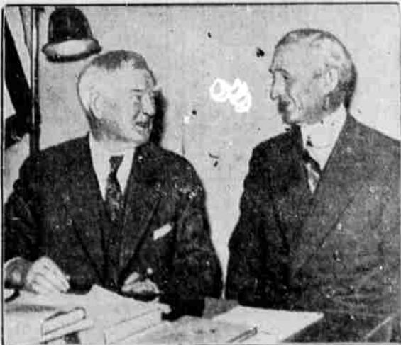
William G. McAdoo (right), former secretary of the treasury, in conference with Speaker John N. Garner in Washington. Mr. McAdoo predicted that Mr. Garner had "an excellent chance" to be the democratic party's standard bearer and told the Texan he would win California's delegation of 44 in the May primaries.