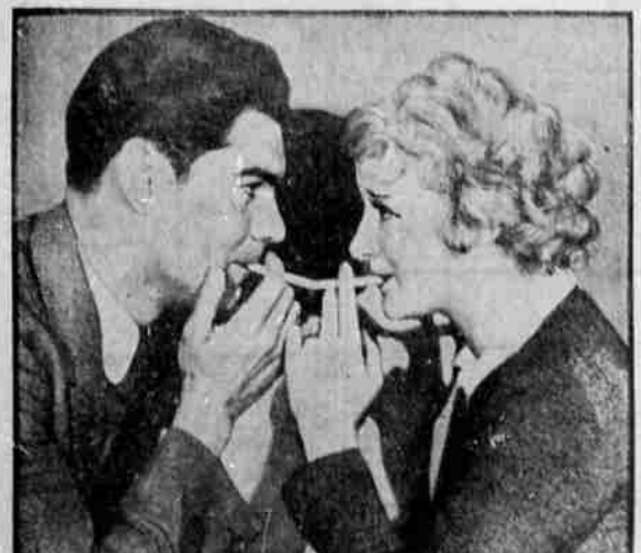
Greta Nissen, film actress who has become the wife of Weldon Heyburn, actor, is shown with him just before their departure from Hollywood via airplane to Tia Juana, Mexico, where they were married.