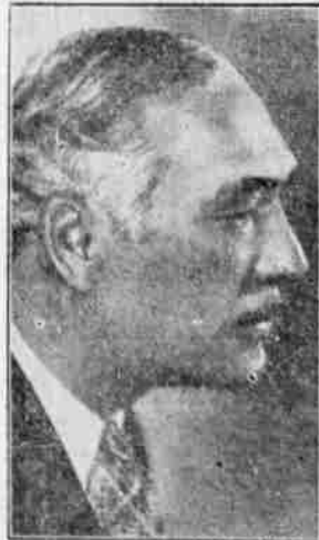
Edwin Carewe, once a leading motion picture director, was indicted in Los Angeles on charges of evading income tax payments amounting to $108,547.