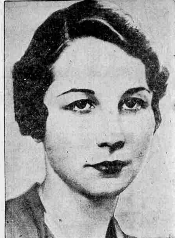
This is one of the first pictures taken of Helen Willis Moody, the tennis queen, since she bobbed her hair. She calls it "just a conservative trim."