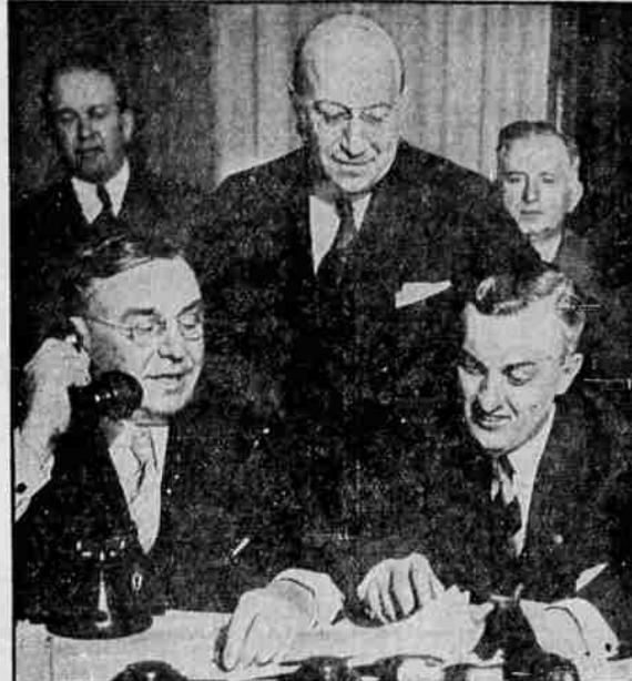
Another political fight between Chicago and downstate Illinois was forecast by results of the state's primary vote, in which Len Small (right), former governor, again was chosen to head the state's republican ticket in the November election. Opposing him will be Judge Henry Horner (center in group at left) of Chicago, democratic nominee whose campaign was sponsored by political forces led by Chicago's mayor, An ton J. Cermak (phone in hand).

SMALL TO BATTLE CHICAGOAN FOR GOVERNORSHIP