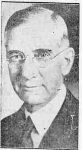
"Prize boob in the history of finance," was the stamp Secretary Arthur M. Hyde placed on his department in giving satisfaction over turning the agriculture department into a money lending agency for benefit of farmers.