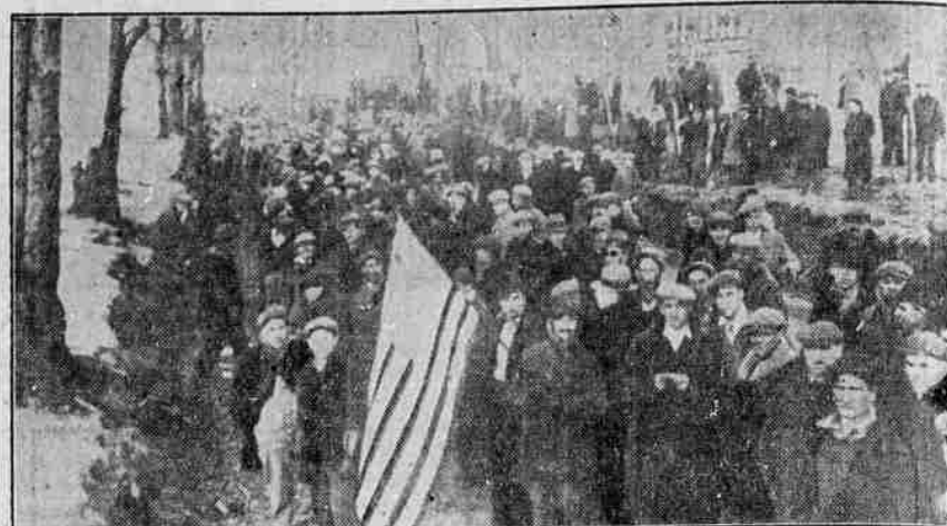
Hundreds of strike sympathizers marched on the Goodyear coal mine near Cadiz, Ohio, precipitating a riot in which one man was killed and scores hurt. Here is part of the crowd gathered on a road leading to the mine. A similar riot near the Harmon creek mine resulted in a second death.