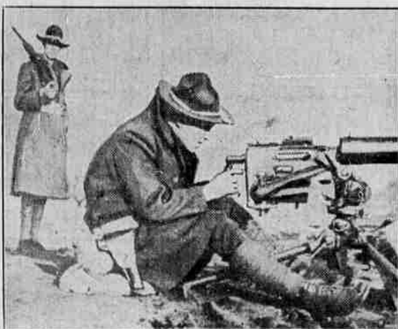
Ohio national guardmen were called to the eastern Ohio coal mine strike area near Cadiz, Ohio, after riots in which two men were killed and a number injured.

SONS OF NASSAU STRUT CAMPUS IN 'BEER SUITS'