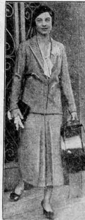
Mrs. Helen Wills Moody is off for her invasion of European tennis courts. She heads the American Wightman cup team and also will engage in big tournaments in France and England before returning to the United States to defend her national title.