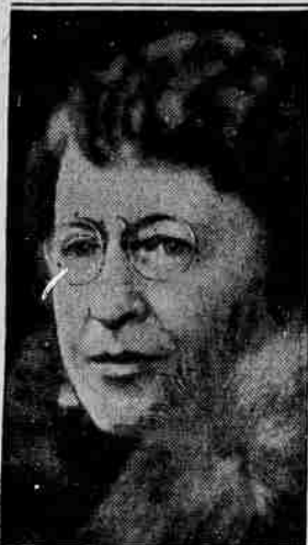
Here is a new portrait study of Mrs. Newton D. Baker, wife of the former secretary of war.