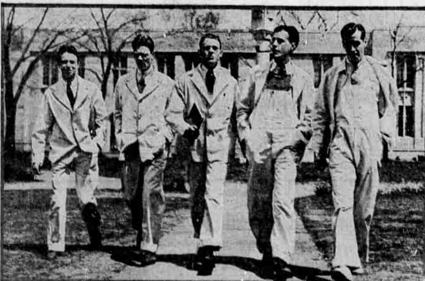
Keeping alive a tradition harking back to 1912 are these seniors of Princeton university, who already have donned their 'beer suits' which will be worn at graduation in June. The suits, merely white overalls with coats to match, according to tradition were donned so Princetonians of another era would not soil civilian clothes when quaffing beer.

SONS OF NASSAU STRUT CAMPUS IN 'BEER SUITS'