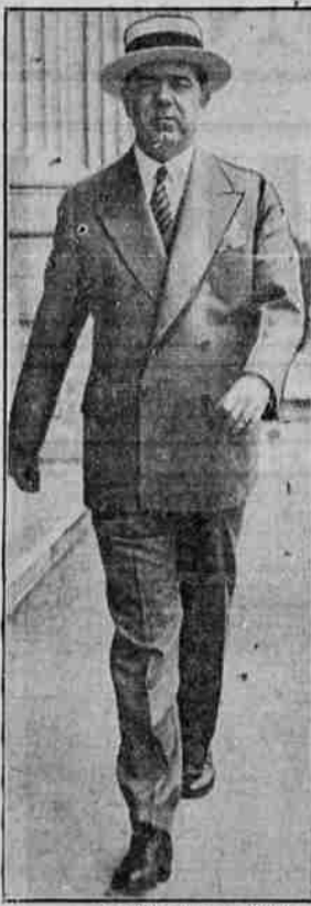
Perhaps Huey Long, fiery Louisiana senator, got over-heated in his recent one man revolt against the senate's democratic high command for here he is out two weeks ahead of time with a new straw hat.