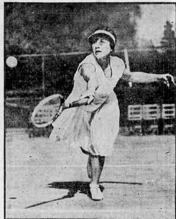
This unusual action shot shows Helen Wills Moody, world's premier woman tennis player, executing a neat backhand shot during her first practice of the season at Pasadena, Cal. Helen this year is aiming at her eighth national singles title.