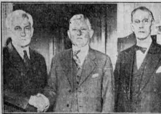
Rep. Gilbert N. Haugen of Iowa was congratulated by Speaker Garner (center) and Rep. Edward Pou of North Carolina (right), house veterans, when he set a new record for continuous service in the house of representatives. When this picture was taken he had served 33 years and 22 days.