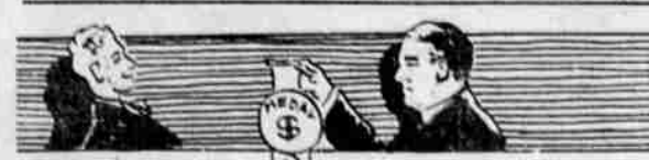
All Rudy Vallee has to do to make a new name for himself is to write a theme song for prosperity. At any rate, when Mr. and Mrs. Vallee called at the White House the President suggested that Rudy sing a song that would make people forget their troubles. A medal would be the reward for success; the President similarly suggested.