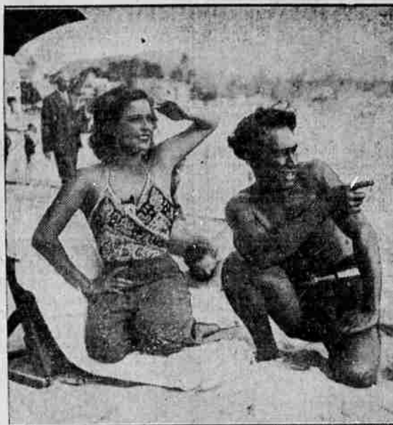
Points of interest around Honolulu were shown Lila Damita, screen actress, by Duke Kahanamoku, famous Hawaiian swimmer, during a recent visit to the tropical islands. They are shown here on the beach at Waikiki with Diamond Head in the background.

PRESIDENT DE VALERA WITH HIS NEW IRISH CABINET