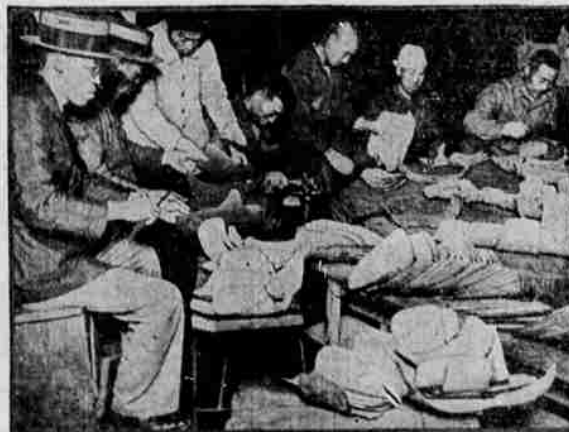
Japanese workmen are shown making bullet-proof vests, or cuirasses, for which considerable demand has arisen since recent assassinations in Tokyo.