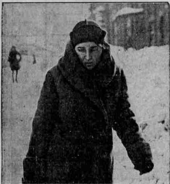
This Associated Press picture is the first ever published of Mrs. Joseph Stalin, wife of Soviet Russia's strong man. She figured in the news recently when she was called to account for cutting classes and failing to return library books promptly at the all-union industrial academy, where she is taking courses in the manufacture of artificial silk. She is enrolled in the school as Nadya Alliluleva, her maiden name, and very few students are aware of her identity. She is extremely modest and refuses to bask in the reflected glory of her husband's career.