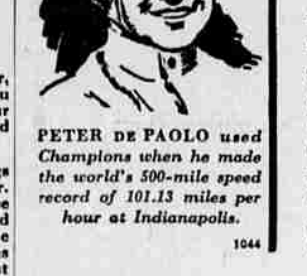
PETER DE PAOLO used Champions when he made the world's 500-mile speed record of 101.13 miles per hour at Indianapolis.

Enjoy better performance for the year to come