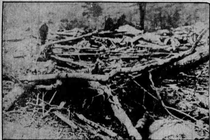
This Associated Press telephoto shows the wreckage of a house in Cartersville, Ga., in which seven persons narrowly escaped death. This was typical of destruction caused by tornadoes in several southern states.