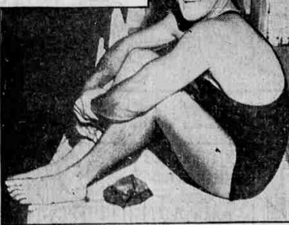
Clarence "Buster" Crabbe, Los Angeles athletic club star, broke his own American record in the 1,500 meter special event of the national A. A. U. championships at New Haven, Conn. He was timed at 19 minutes 45.35 seconds, bettering his old mark by more than 20 seconds.