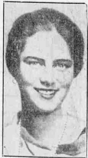
Reports from Bucharest say Queen Marie is buying clothes for a grandchild expected by the former Princess Ileana (above), her daughter. The princess was married last year to Archduke Antoine of Hapsburg.