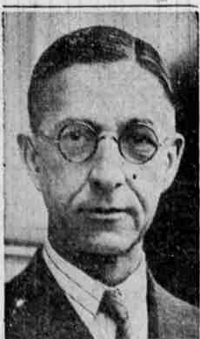
A formal attempt to unseat Senator Josiah W. Bailey of North Carolina on charges of fraud in the 1930 North Carolina elections was laid before the senate elections committee. The committee will decide whether the charges warrant further investigation.