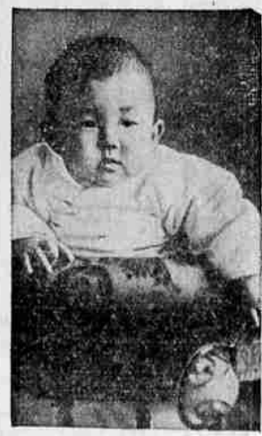
This little lady is Princess Yori, youngest daughter of the emperor and empress of Japan. She's just a few days over a year old, and her full name is Atsuko Yori-no-Mi.