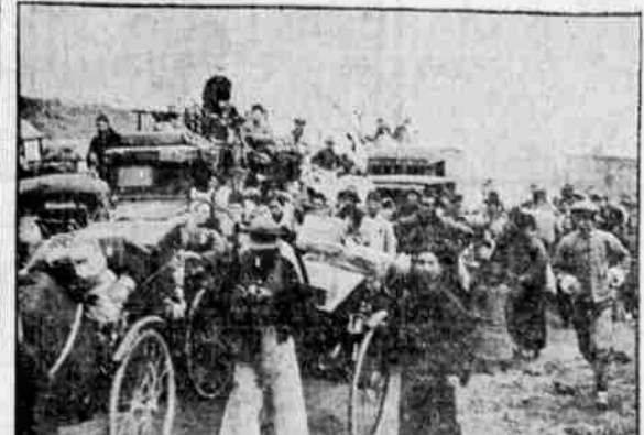
When inhabitants of a Chinese village north of Shanghai heard the cry, "The Japanese are coming," they packed up bag and baggage and fled for safer territory. This picture shows them on the march to new and unknown homes.