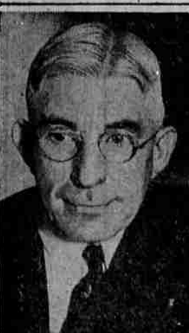
Louis J. Taber, master of the national grange, will seek the United States senatorial nomination in the Ohio May primary. He is a republican.