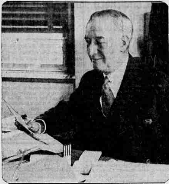
Alfred E. Smith, former governor of New York, reading messages of congratulations on his victory in the primaries in Massachusetts and his showing in Pennsylvania. His smashing victory in New England and reports from Pennsylvania brought this comment: "Well, I guess this will put a chock under the bandwagon."