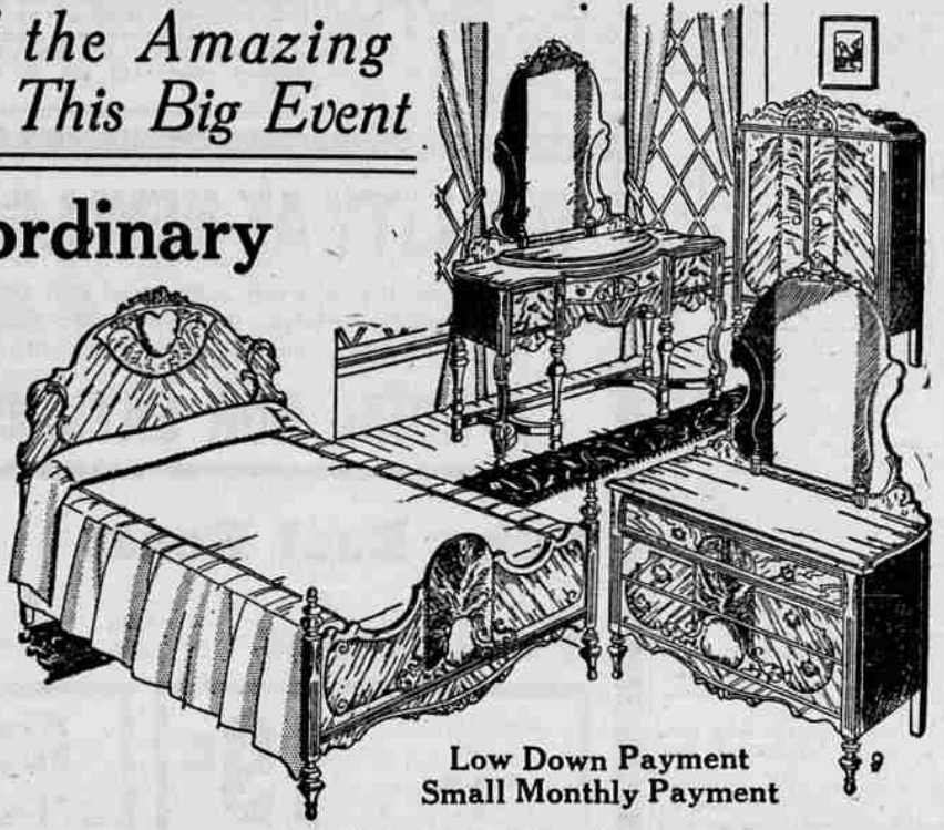
Low Down Payment Small Monthly Payment

are Still Left in BEDROOM and DININGROOM Suites PRICES ARE