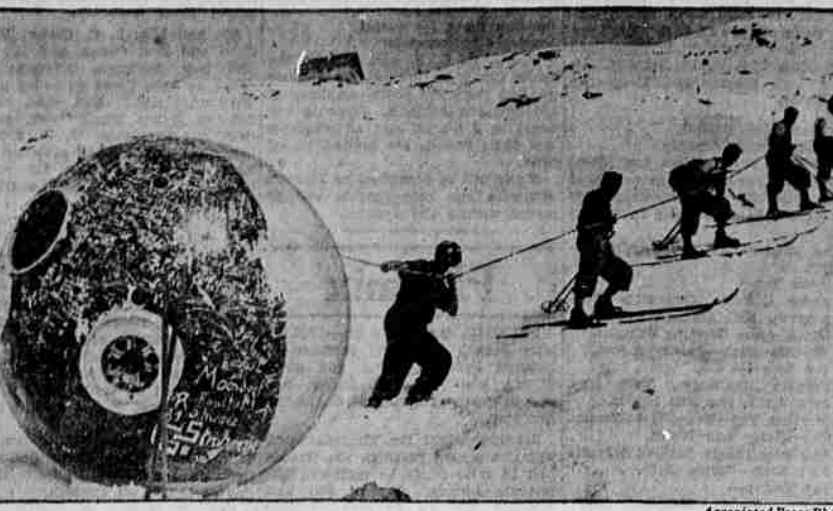
This picture, made in the Tyrolean Alps, shows workmen starting the difficult transportation of Prof. Auguste Piccard's "stratosphere" balloon gondola to Brussels, where the Belgian physicist is organizing another ascension. Because of a promise to his wife, Piccard himself will not go on the next expedition, which he hopes will reach 12 miles into the stratosphere.