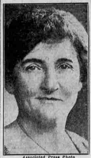
Governor Russell of Georgia is expected to name Mrs. William J. Harris to fill the senate seat left vacant by the death of her husband.