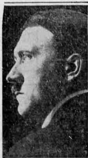
Adolf Hitler, leader of the national socialists in Germany.