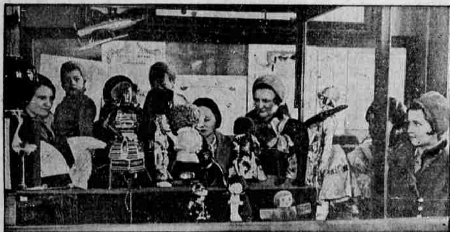
The famous Lindbergh collection, representing gifts from all over the world, has taken on added interest for St. Louisans since the kidnaping of the famous flier's son. Here are shown some of the many persons who daily inspect the collection of dolls in the museum of the Missouri Historical society.