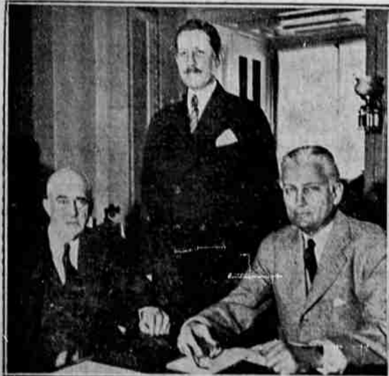
Two members of the senate territories committee are shown here with Secretary of War Patrick J. Hurley, who indignantly strode from a committee meeting at which he was being questioned about Philippine independence, saying he would not "remain to be called a liar." The incident was later smoothed over. Senator Hawes (D., Mo.) is at the left, and Chairman Bingham (R., Conn.) at right.