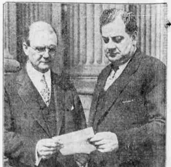
Sensators Warren Barbour (right) of New Jersey and Roscoe Patton (left) of Missouri are shown on the steps of the capitol in Washington as they discussed a bill by the latter to punish by death kidnapers operating across state lines. They are pressing the bill following the kidnaping of Charles A. Lindbergh, Jr.