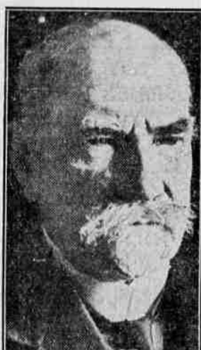
Fighting broke out between Finland's government troops and a force of Finnish fascists after the latter sent a note to President Pehr Edvin Svinhufvud (above) demanding that the cabinet resign and a new one be chosen.