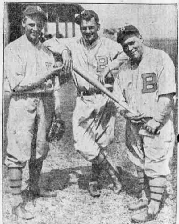
Hack Wilson in a new uniform and with a new bat is shown with business in the Brooklyn Dodgers' spring training camp at Clearwater, Fla.