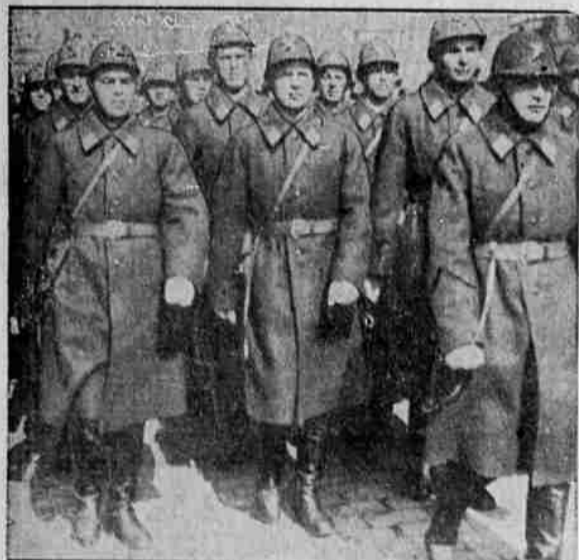
Soviet soldiers are being concentrated along the Manchurian border according to advices reaching Tokyo. Two army corps were in the immediate vicinity of Vladivostok, the reports said. Here is a typical company of Soviet infantrymen on the march.