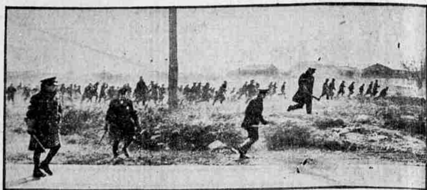
Four men were killed and about 30 wounded when some 3,000 unemployed marchers overpowered police at the city limits of Dearborn, Mich., and forced their way to the gates of the Ford Motor company's River Rouge plant. Police are shown here in retreat. They returned with reserves and finally dispersed the mob.