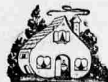
The Happy Kitchen

We have made every preparation for the Kitchen Chautauqua—and remember, it's your cooking school. We know you'll enjoy it... that's why we arranged to bring it to you. We invite you to reserve each one of the days—NOW.