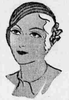
Hat Shop 2nd Floor