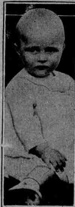
SHE'S POPULAR in Norway, for she is Princess Ragnhild, daughter of Prince Olaf and Princess Martha of Norway. The little princess is just 15 months old.