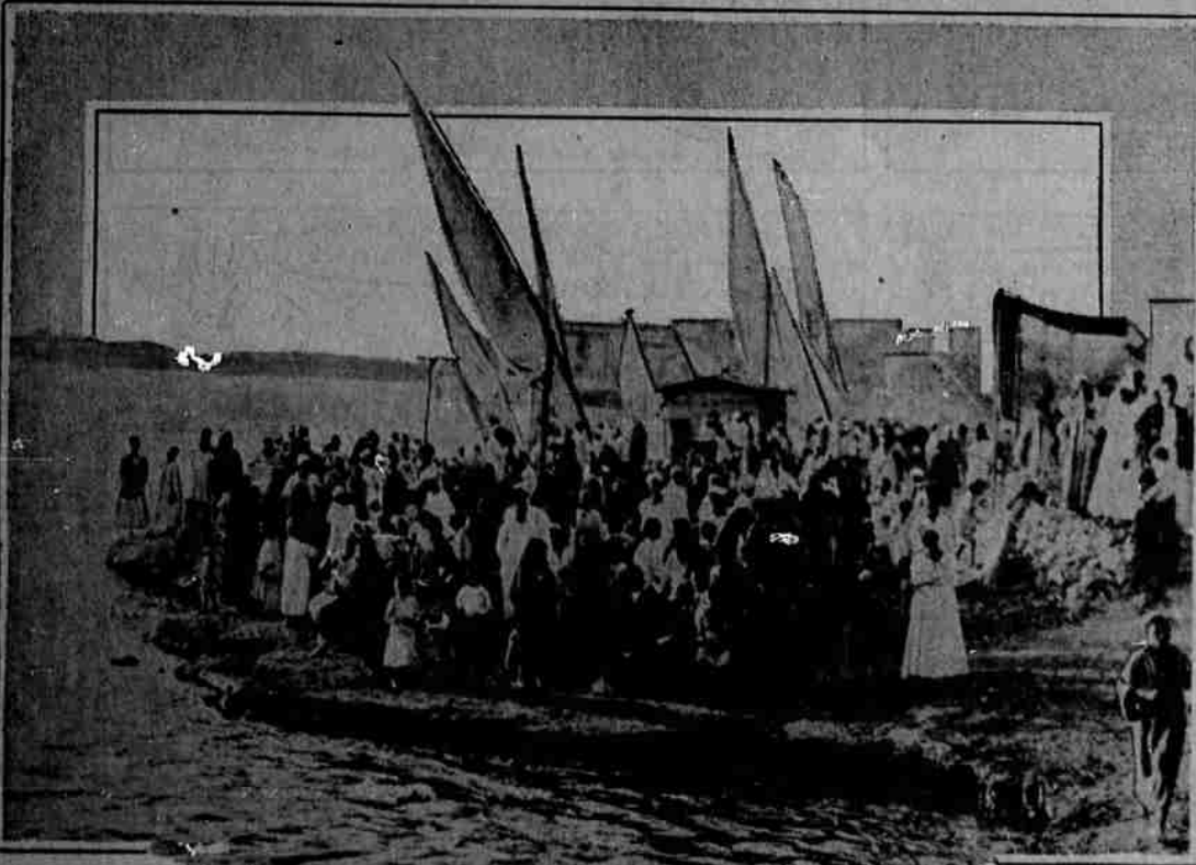
EGYPTIANS IN ANNUAL FESTIVAL TO RIVER NILE are seen here on the banks of the historic river waiting for the "Akaba," the boat which is especially decorated for the occasion, to take them from Kasr El Nil bridge to old Cairo for the celebration. In ancient times the most beautiful virgin maiden was sacrificed to the gods of the Nile, but now a religious ritual has taken the place of the sacrifice.