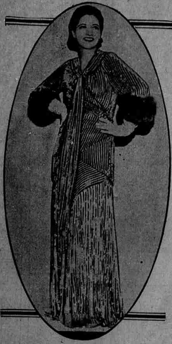
IT'S REALLY A SCARF , though it looks like a frock. Kay Francis, movie star, is displaying this unusual creation. It has semi-raglan sleeves, with a wide band joining the top of the sleeves, forming the scarf. The fur is blue fox, while sun-tan chiffon and gold sequins make the wrap, worn over as evening dress, distinctly novel.