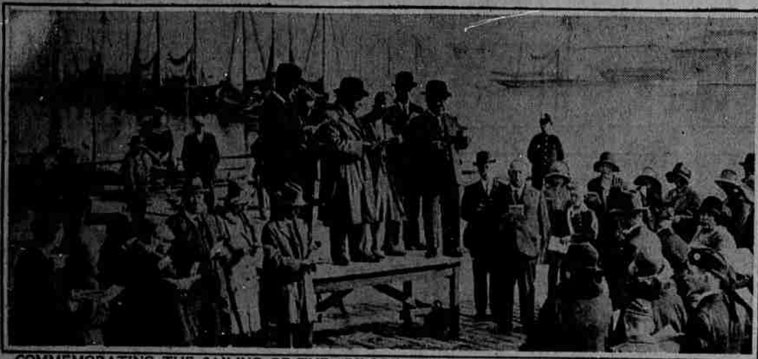
COMMEMORATING THE SAILING OF THE "PILGRIM FATHERS," this little group is seen on the site of the Mayflower Stone, at Plymouth, England. It was from this spot that the Pilgrims sailed in their ship, Mayflower, 311 years ago, in 1620, on their historic journey to the rock-bound coast of North America. The above services are held in memory of this great event, and the surrounding atmosphere—wharves, ships, masts, and seamen—lend color to the occasion.