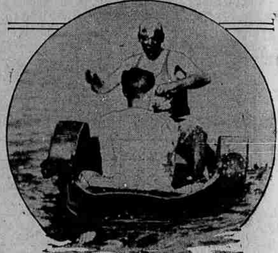
THINGS WERE BLACK AND WHITE in this battle of soot and flour during the regatta at Southend, England. One contestant had a bag of soot; the other, a bag of flour. The boat rocked precariously while the throwing was going on, and perhaps it tipped over—as it should have done—so we can't tell who won.