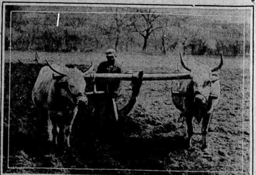
PLOWING IN FAR-AWAY BULGARIA is still done in many parts with oxen, and here is a typical and picturesque landscape at Kazanlik, South Bulgaria. The plow also is antiquated, fashioned entirely of wood. The oxen plod along, seemingly half asleep, and the farmer, with strong hands and brawny arms, manages the plow, which does little more than root up earth.