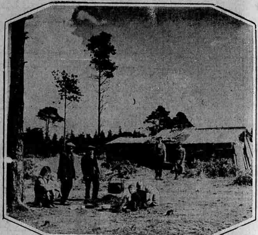
PARADOX! PERMANENT HOME FOR NOMADS! Here is a permanent gypsy home in Surrey, England, tried as an experiment and found to be successful. The nomads are seen with their ramshackle shack in a beautiful natural setting. They live happily, apparently no less free as settlers than as wanderers.